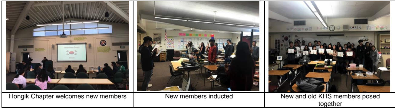
Hongik Chapter welcomes new members